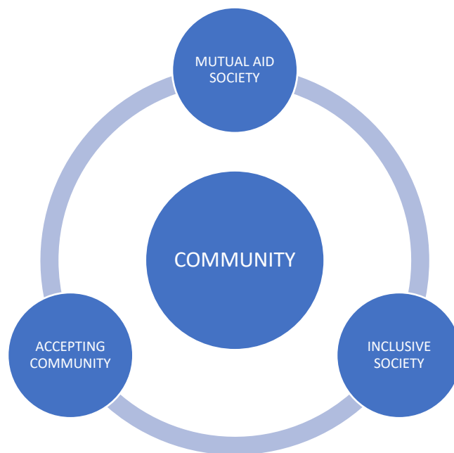
Figure 2: Humanism and Community

Kaplan (1974:202) noted that Kaunda's humanism was also partly a rejection of "Communist doctrine" and underlined what Kaunda considered to be true African socialism. In "humanism", Kaunda drew on several concepts familiar to most African governments' stated philosophy and relied, for inspiration, on Christian concepts of man and society (Kaplan 1974:223). This is no wonder why the Church in Zambia reacted very positively to Zambian humanism (Mijere 1978:356). Churches volunteered to use their pulpits to spread "the good message of humanism" (Njovu 2002:36; Mijere 1978:356). Archbishop M. Mazombwe at one time directly addressed Kaunda by telling him, "Your Excellency, you cannot doubt that the Churches supported the philosophy of Zambian Humanism when you first elaborated it" (Kaunda and Mazombwe 1982:254). Indeed, Kaunda and the ideal of humanism were compatible with the Christian message.